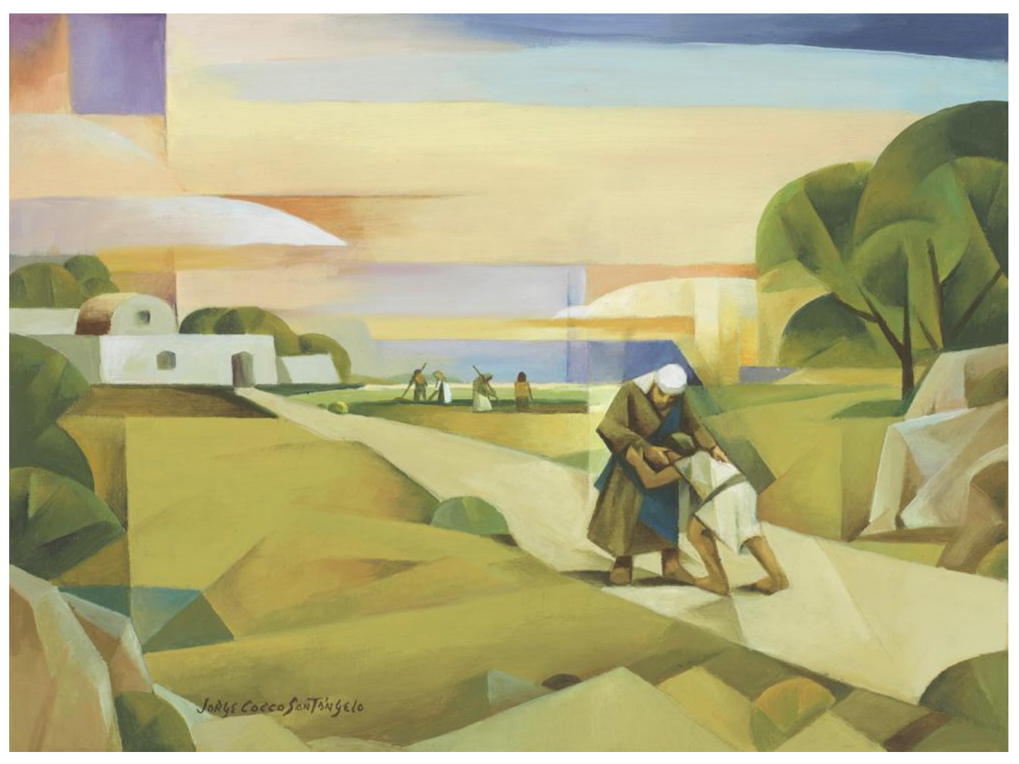
Prodigal Son by Jorge Cocco

Fairmount Presbyterian Church 2757 Fairmount Boulevard Cleveland Heights, OH 44118 216.321.5800