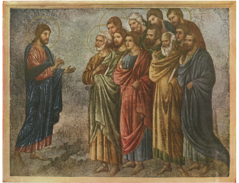
Duccio di Buoninsegna (c. 1255-c. 1319), "Jesus Teaching", 1308-11.

St. Bartholomew's Episcopal Church Baltimore, Maryland