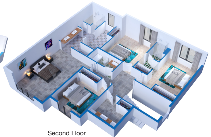
Second Floor 1610 sqft / 8' clg

Almost 3,200 finished square feet of living space in a well thought-out floor-plan! This two-story highlighting an abundant amount of kitchen cabinetry space, large walk-in pantry and windows in all the right locations to catch amazing views of the sunset. 4 bedrooms, laundry, Jack n' Jill and additional bathroom all of the second floor are complemented by the extremely spacious master suite with walk-in closet and tiled walk-in shower.