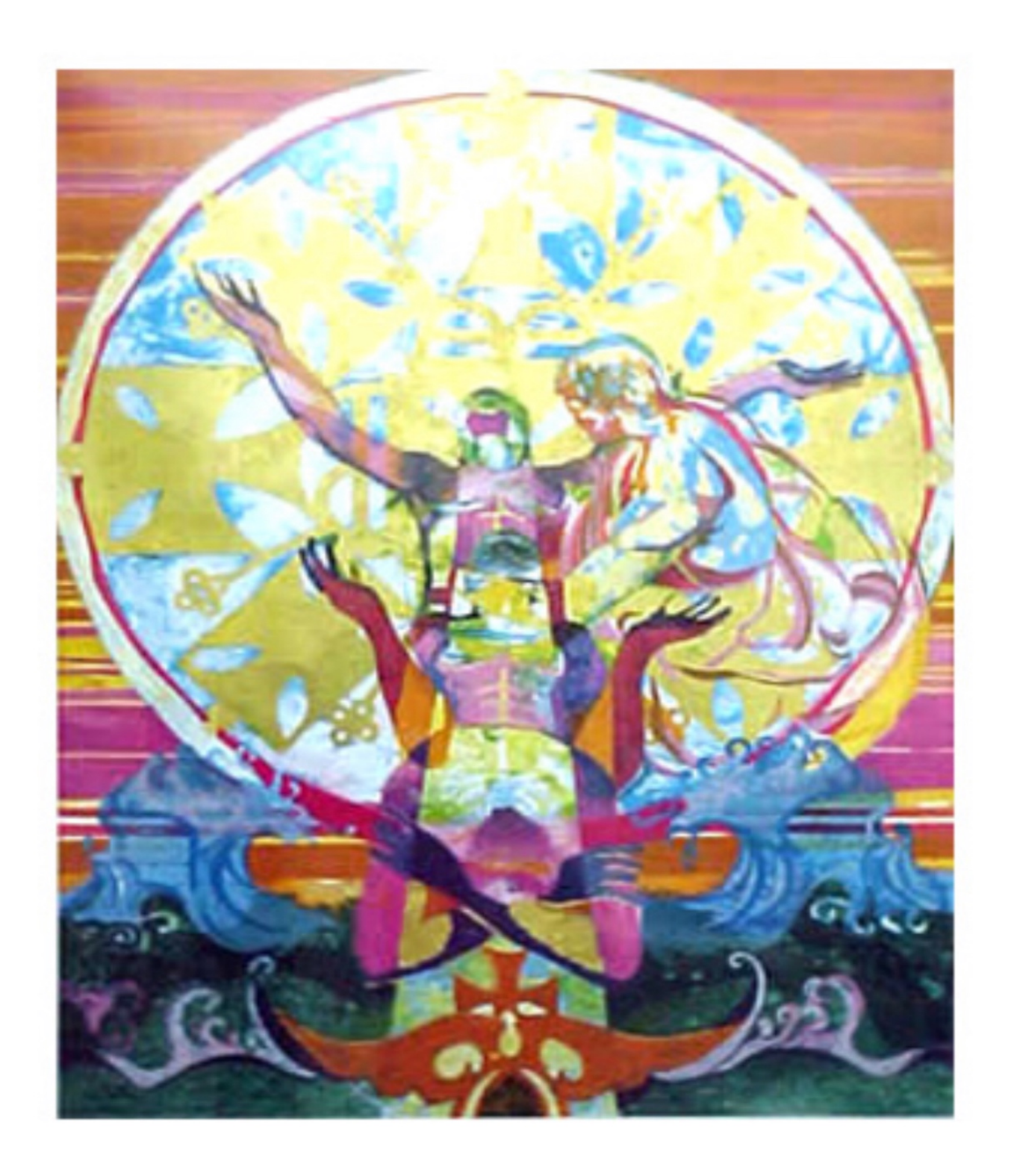
May 2, 2021

2363 S. Germantown Road Germantown, TN 38138