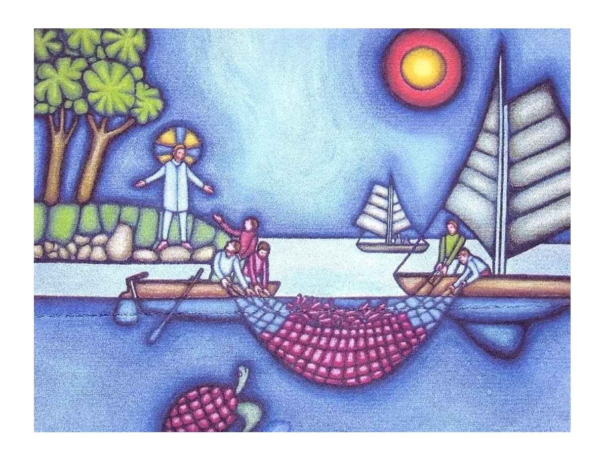
February 6, 2022 8:30A.M. & 11:00 A.M.